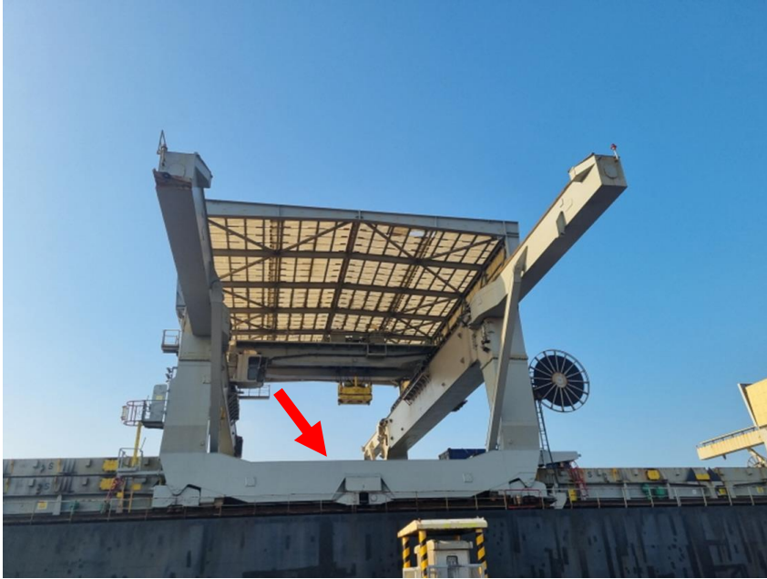
Cargo landed on the beam of the vessel's gantry crane.